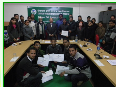
Winners of the Hindi Competitions