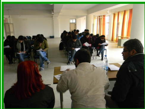
Students taking part in the Competitions