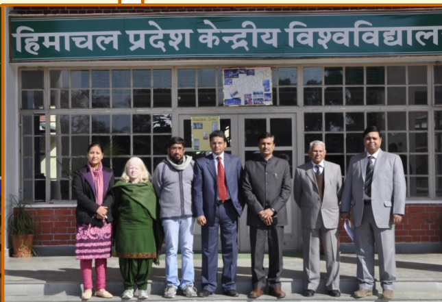
Members of the Visiting Team along with the Faculty from School of Education